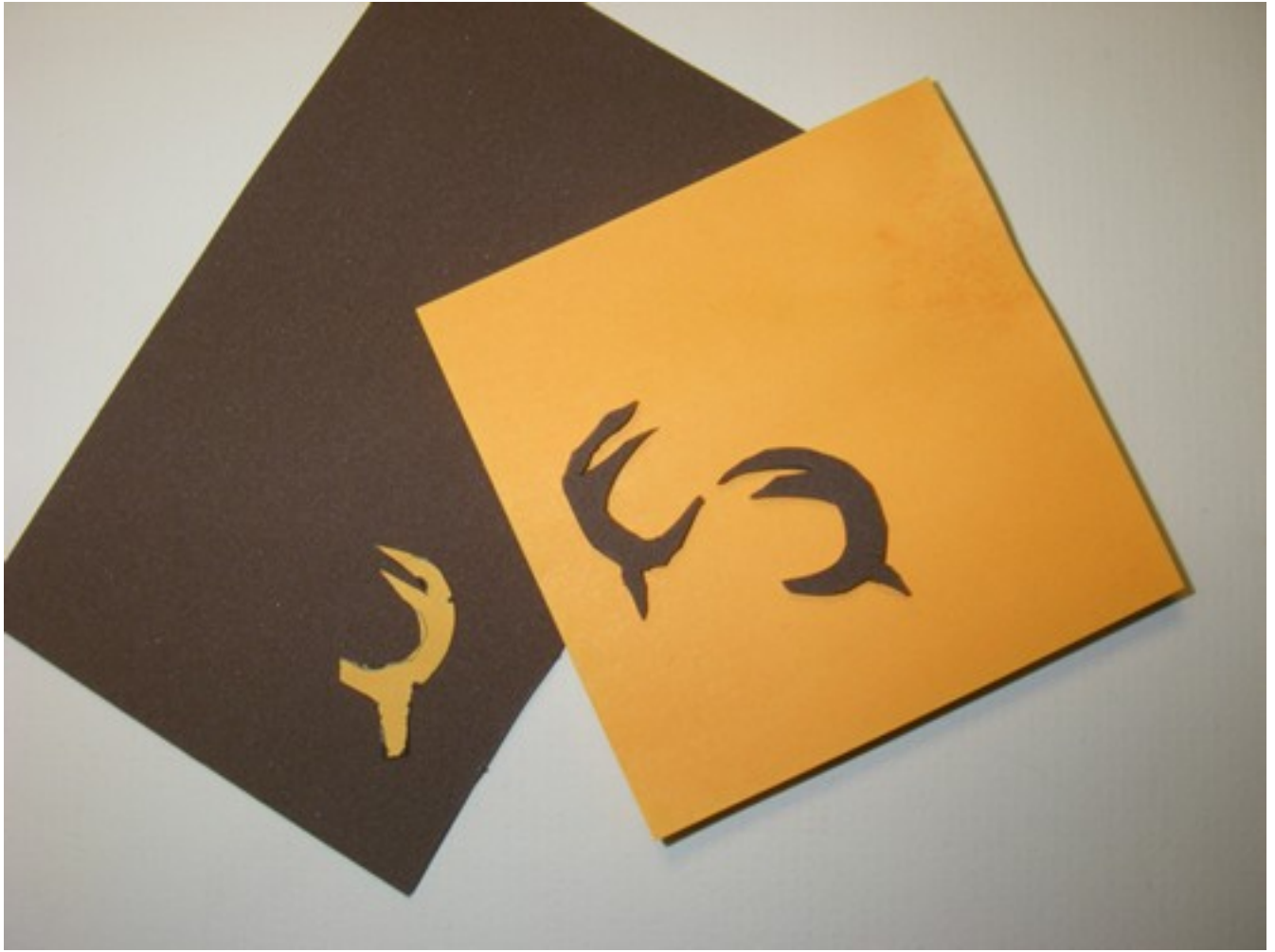
Step 8. Cut out ears from a piece of chamois