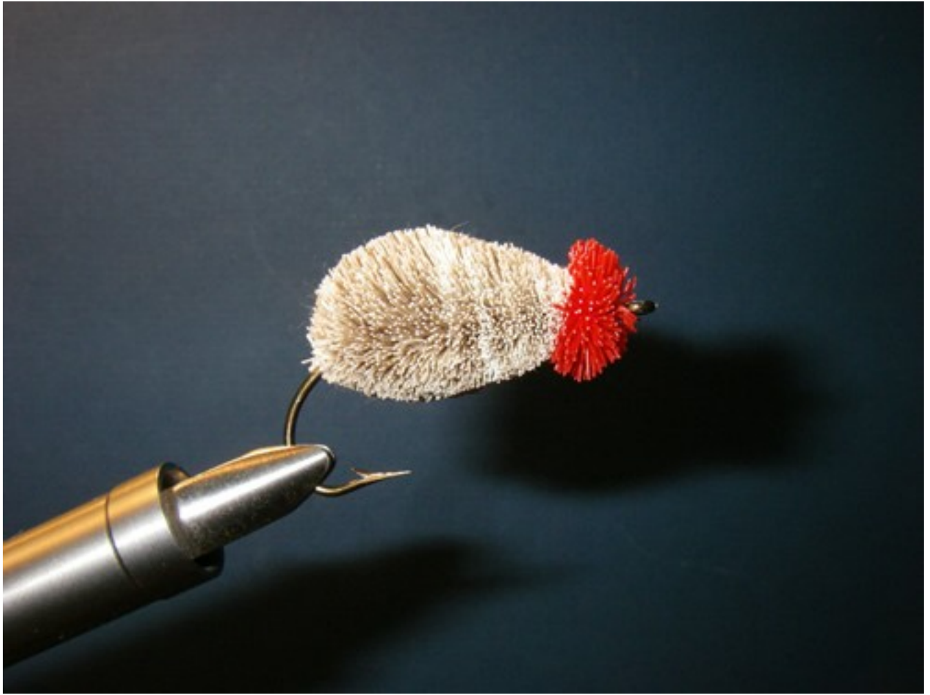
Step 7. Cut out antlers from a piece of 2mm fly foam.